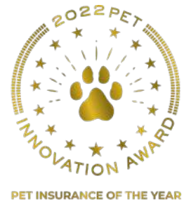
PET INSURANCE OF THE YEAR

A. MetLife Pet Insurance 1 provides among the shortest wait periods for accident and illness coverage. 6 Accident coverage and optional Preventive Care coverage begin on the effective date of your policy. Illness coverage begins 14 days later.